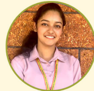
APEKSHA K GINGER MEDIA